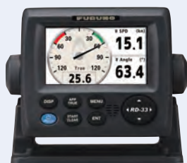
Remote Display RD-33

■ The PG-500 is subject to magnetic anomalies, such as magnetic deviation due to steel hull, onboard cranes, nearby huge ships, marine cables, etc. as well as the local magnetic variation.