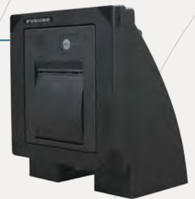
Optional Printer: PP-900 *Interface Unit IF-2550 Required