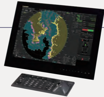
Model: FAR-3005 Series

Featuring total integration of Radar and ENC Display System, FURUNO Chart Radar series display the Radar images together with ENC at the same time.