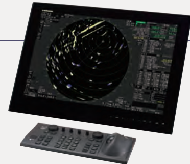
Model: FAR-23x8 Series

The latest digital signal processing technology and highly receptive antenna enables the Radar series to detect targets and show echoes with crisp images on your monitor, whether ships are moving fast around your vessel or located miles away.