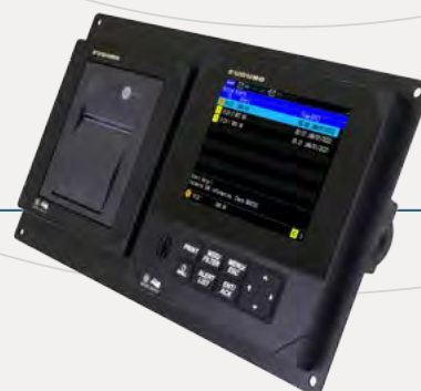
Model: NX-900 (display with a PP-900 printer)

The NX-900 can receive the NAVTEX messages on 518 kHz and 490 kHz or 4209.5 kHz at the same time.