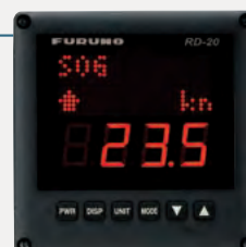
Model: RD-20 (144mm x 144mm)

The RD-20/RD-50 display data from onboard sensors. The displays are switched by a remote controller and display brilliance of all units can be centrally controlled from one dimmer unit.