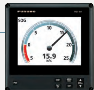
Model: RD-50 (240mm x 240mm)